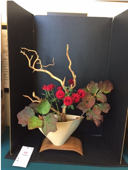
Ft. Smith Rose Society Fall Show Winners In Design